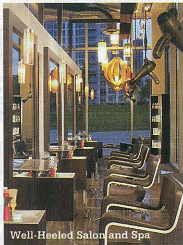
Well-Heeled Salon and Spa

Skip the slot machines and spend your dough at The Spa at Wynn Las Vegas . Detox in the eucalyptus steam room, or settle in for a soak in the shell-shaped Jacuzzi. (3131 Las Vegas Blvd. S., wynnlasvegas.com , 702-770-3900; available to nonresort guests Mon.-Thurs.)