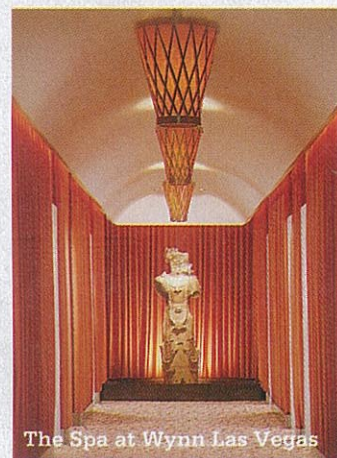
The Spa at Wynn Las Vegas